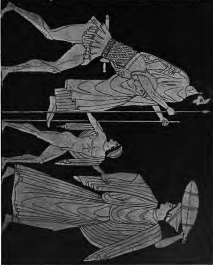
Fig. 98. Aeneas fleeing from Troy.